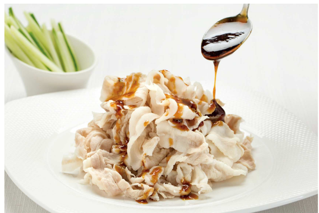
蒜泥白肉 Sliced Pork with Garlic Sauce