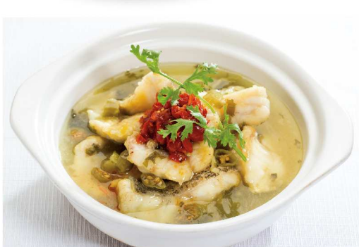
潑辣酸菜魚 Pickled Cabbage Fish with Crushed Chili