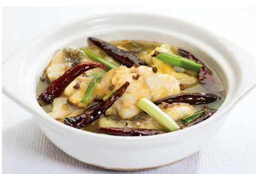
水煮魚 Poached Fish Szechuan Style